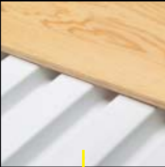
Roof Deck with Plywood Floor