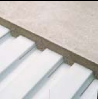
Roof Deck with Concrete Floor