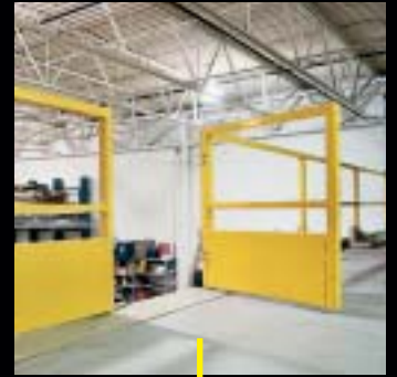
Spring Loaded Swing Gates