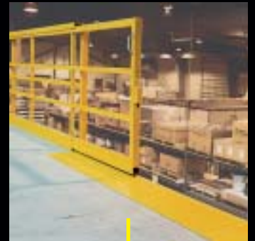
Remote Powered Sliding Gates