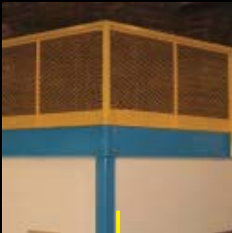
Expanded Metal Railing