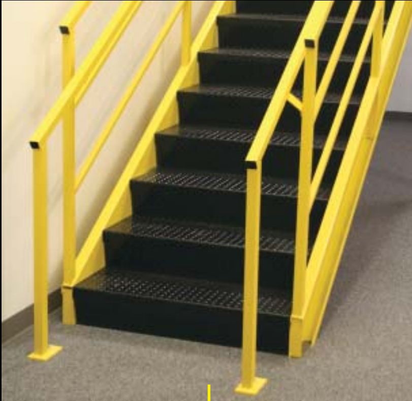
Code Approved Stairs