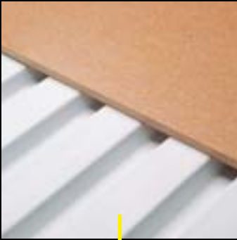
Roof Deck with High Density Wood