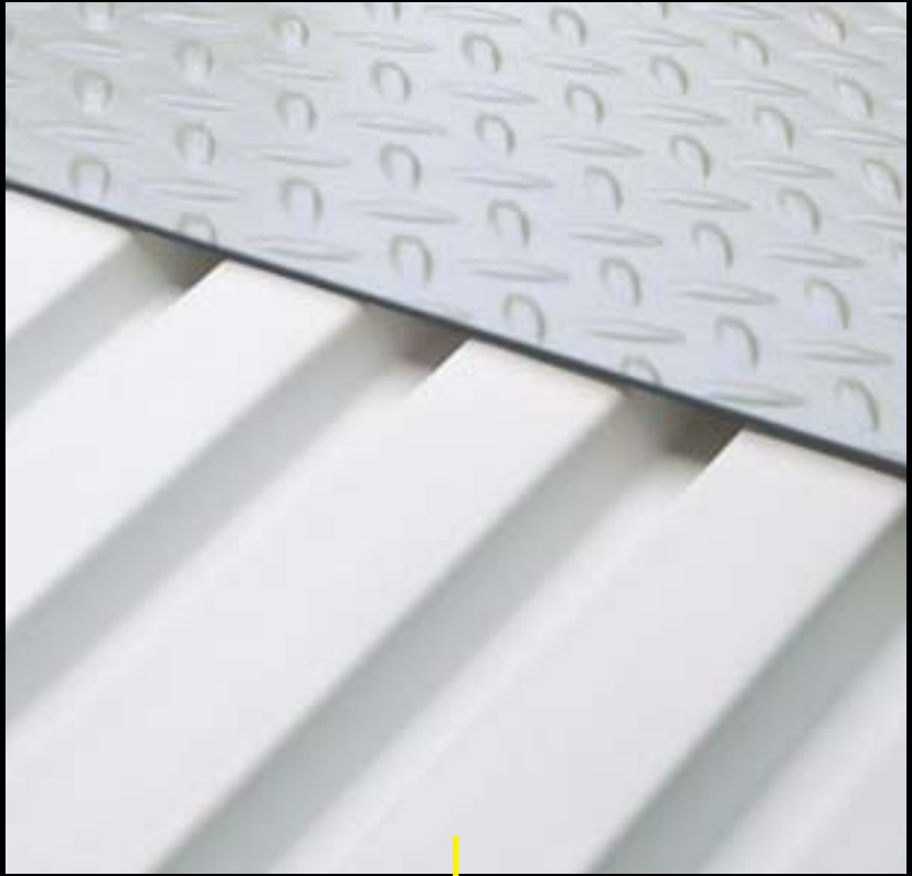
Roof Deck with Steel Floor Plate