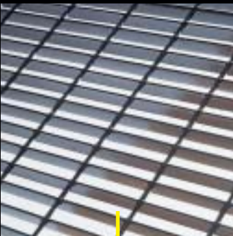
Heavy-Duty Steel Bar Grating