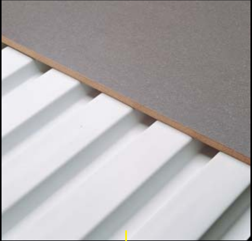
Roof Deck with Painted High Density Wood