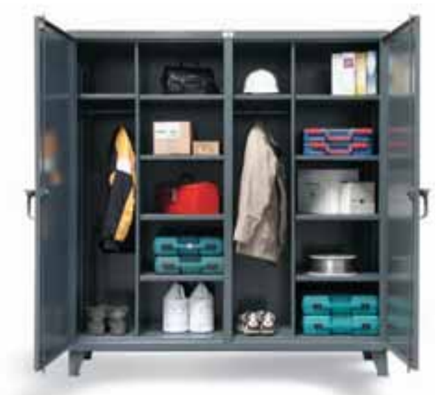
As Shown... Product Number...66-DSW-2410