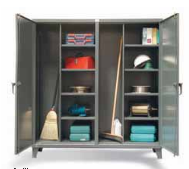
As Shown... Product Number...66-DSBC-248

These double shift cabinets provide two separate wardrobe compartments. Companies with a second shift can secure one shift's valuables while the other shift is on duty. They are ideal for use as a tool cabinet, housekeeping or personal locker. They can be accessorized with drawers, vertical shelf dividers, slide out shelves and hanger shelves without the rod.