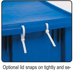
Optional lid snaps on tightly and securely to protect container contents. As pictured, lids can be fastened and locked for added security.