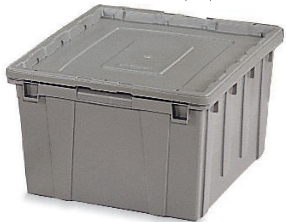
NO2420-12 with RCNO2420-1 (cover)