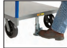
Floor Lock Option

Sturdy all-welded unit is constructed of a formed 12 gauge steel deck with extra reinforcement on underside. Removable pipe handle is 1-5/16" OD and has two cross braces. Two swivel and two rigid casters with choice of wheels. Durable powder coated finish. Ships fully assembled and ready for use.