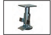
Optional Floor Lock -FL