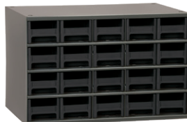
19320 – 20 Drawers