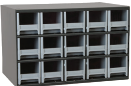
19715 – 15 Drawers