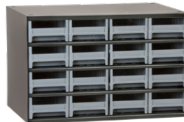
19416 – 16 Drawers