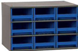
19909 – 9 Drawers