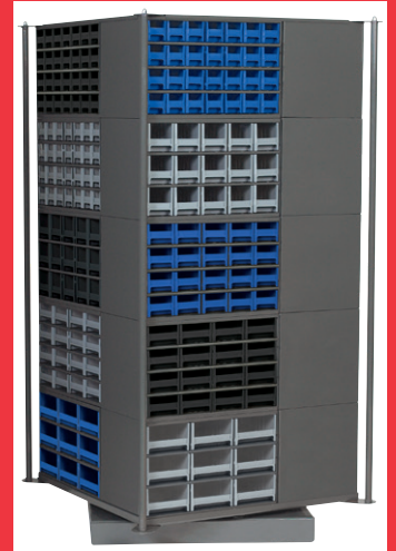
Mix or match color options and drawer sizes.