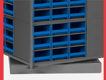
Turntable base rotates for easy access to parts.