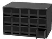
Any 20 Steel Storage Cabinets