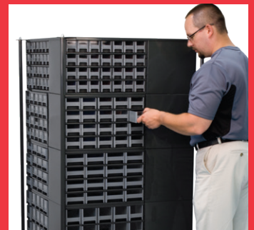
Securely holds 20 cabinets (sold separately)