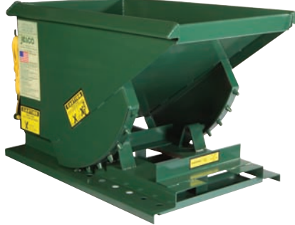
<sup>1</sup>/<sub>3</sub> cu. yd. shown