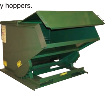
Type A Front half opens only