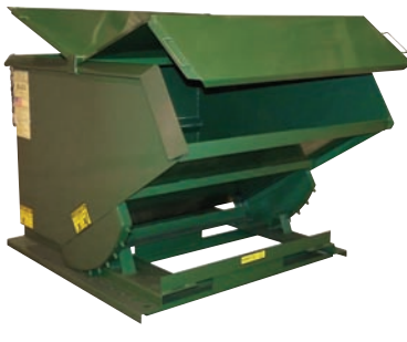
Type C Both halves open