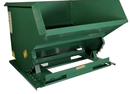
2 cu. yd. shown

7 gauge body Base: 8 gauge (1/4-1/2 yd.) / .220 gauge (3/4-21/2 yd.) Stackable 3 high empty