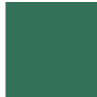
RACK Green RAL 6028