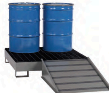
4-Drum Forkliftable with Ramp