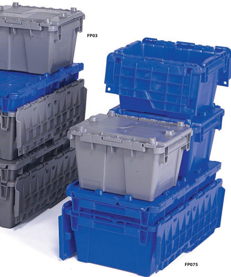
NO2420-12 with RCNO2420-1 (cover)

Distributed by: Custom Equipment Company 866-333-0728 sales@custommhs.com www.custommhs.com