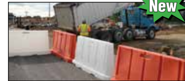
COUPLERS CONNECT MULTIPLE UNITS EITHER STRAIGHT OR AT 90° ANGLES