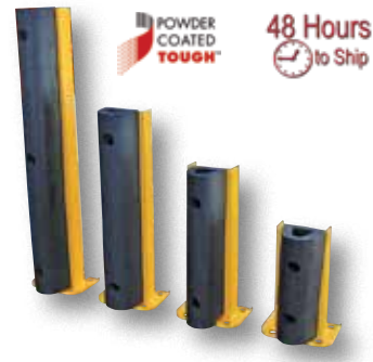
STRUCTURAL RACK GUARDS WITH RUBBER BUMPERS