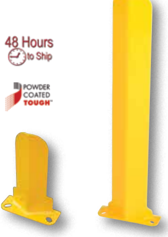
model NPG6-36 model NPG4-12