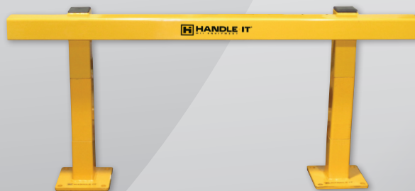
Single rail with extension