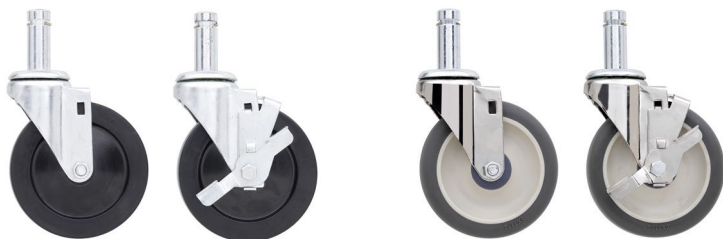
Resilient Rubber Casters

Note: The post used on the carts is model number 63UP.