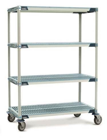
Four Tier Cart