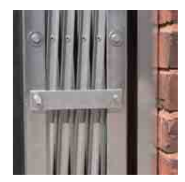
Retainer straps hold door gates in retracted position.