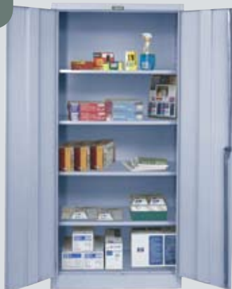
STORAGE Model 815 Shown in Platinum