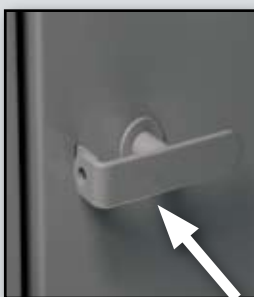
Heavy-Duty 3/16" thick steel handle with padlock hasp.