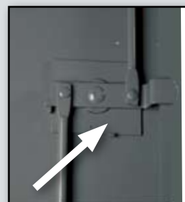
1/8" thick latch and 3/8" diameter lock rods insure maximum security