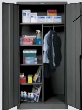
COMBINATION Model 855 Shown in Midnight Ebony