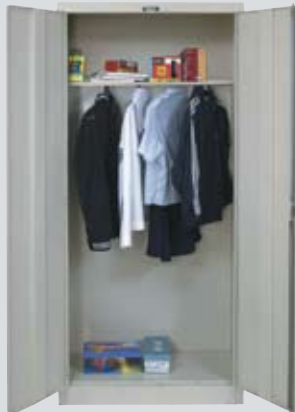
WARDROBE Model 835 Shown in Parchment