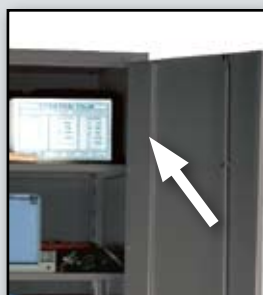
18-gauge full-height door stiffener provides maximum rigidity to both doors