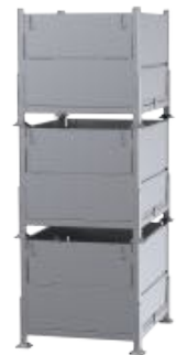
STACKED 3 HIGH FOR TRUCK SHIPMENT