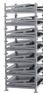
STACKED 7 HIGH FOR TRUCK SHIPMENT