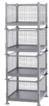
STACKED 4 HIGH FOR TRUCK SHIPMENT