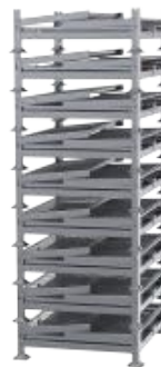
STACKED 9 HIGH FOR TRUCK SHIPMENT