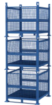
STACKED 3 HIGH FOR TRUCK SHIPMENT