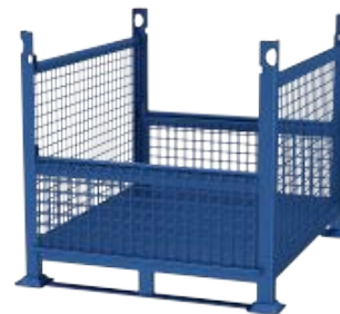
2 GATES OPEN