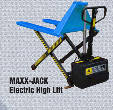
MAXX-JACK Pallet Truck