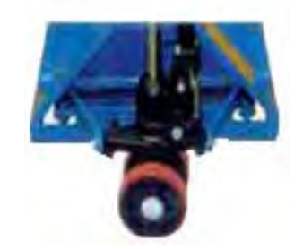
Comes standard with Nylon Wheels . Poly wheel with steel hub optional.