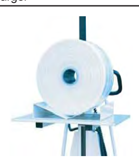
Attachment A-1 is used for rolls or coils that require lifting from underneath. Ideal for placing rolls on and off a shaft.