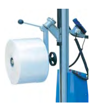
Attachment A-4 is a roll handling attachment designed to handle rolls in the vertical and horizontal position (poker chip position). The unit features an expandable ram that hold the roll by expanding in the core and turning the wheel pictured. The ram is 11" long and is 2.9" in diameter.