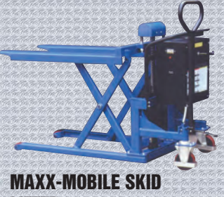
MAXX-MOBILE SKID LIFTER Manual & Electric