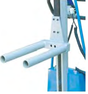
Attachment A-3 is a dual ram arrangement. The ram length is 17.75" long and 2" in diameter. The distance between the rams is 6". It can be used to cradle rolls or can handle two small rolls at one time through the core.