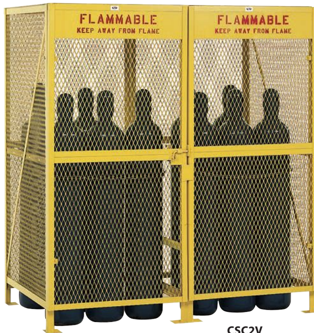
CSC2V VERTICAL STORAGE CABINET