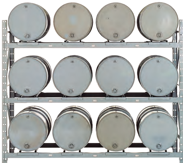
DPR12 12 DRUM PALLET RACK