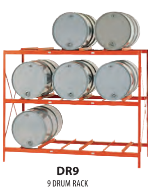
DR9 9 DRUM RACK