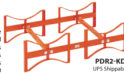
PDR2-KD UPS Shippable

All welded PDR2 is identical except for bolts