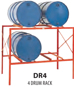
DR4 4 DRUM RACK