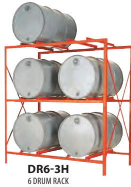
DR6-3H 6 DRUM RACK