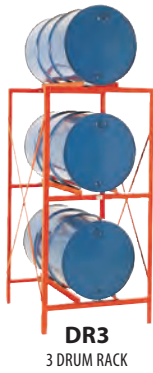
DR3 3 DRUM RACK