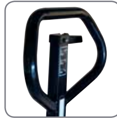
Ergonomic handle ensures the user a relaxed hold. Can be marked with name/department.

Stainless and explosion proof pallet trucks are also available.