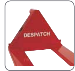
The company name or logo can be cut out in the triangle of the Thork-Truck.