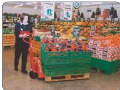
Adjustable fork height - no problems when handling low and worn pallets.