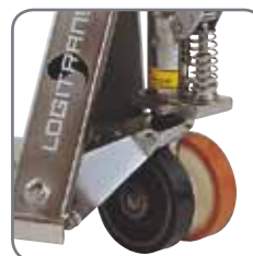
Different wheel types, to suit the needs of the user.