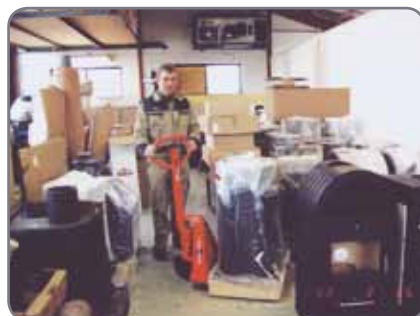
An easy handling of goods is ensured even in very confined spaces.