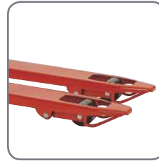
The hoop skates on the forks ensure an easy fork insertion and withdrawal in/out of pallets.