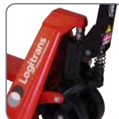
Permanent quick lift.