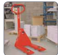
Thork-Truck is available with different fork lengths.