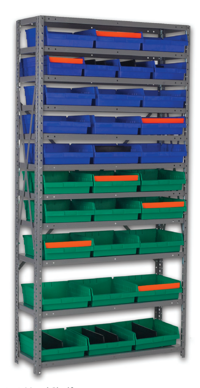
M1236-13 Metal Shelf, SB1211-4 and SB188-4 bins with Kanban System