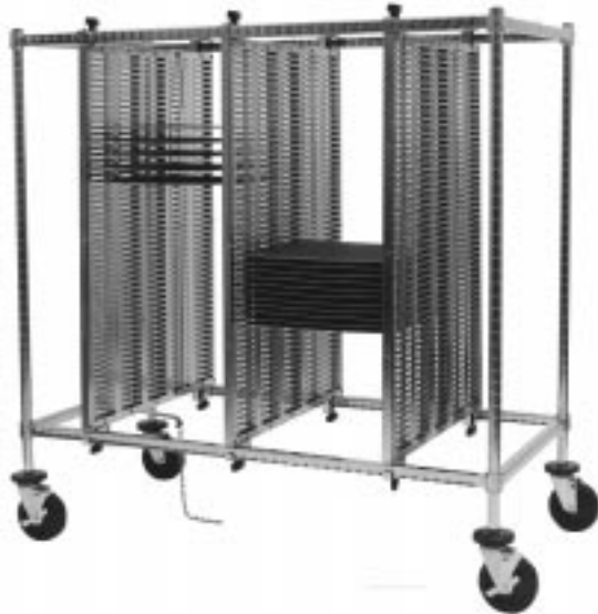
Benchside Model with Optional Center Panel